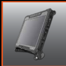
A140 with Multi-Function Hard Handle as Kickstand