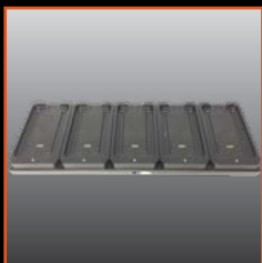
SnapBack Battery Charger