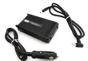
Vehicle Power Adapters

All specifications and descriptions are subject to change. Please confirm full description and specification when placing orders.