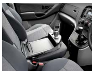
Universal Vehicle Dock