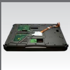
PCI/PCI-Express 3.0 Expansion Unit