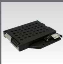
Multimedia Bay 2nd Storage